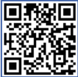
Raffle Ticket Purchase