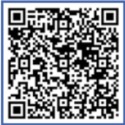
Karaoke Music Playlist